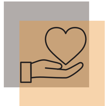
SUPPORTING OUR STUDENTS