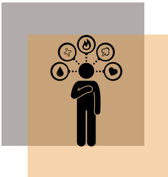
WHY EMOTIONS MATTER